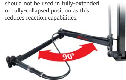
Model QTA020 shown

Position arm at 90° angle for optimum torque reaction performance. Arm should not be used in fully-extended or fully-collapsed position as this reduces reaction capabilities.